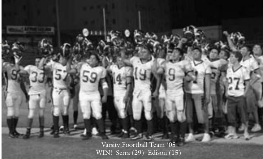
Varsity Foortball Team '05 WIN! Serra (29) Edison (15)