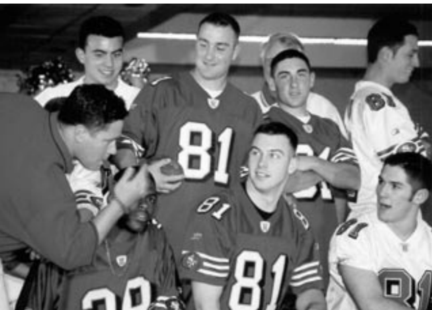
(L to R)