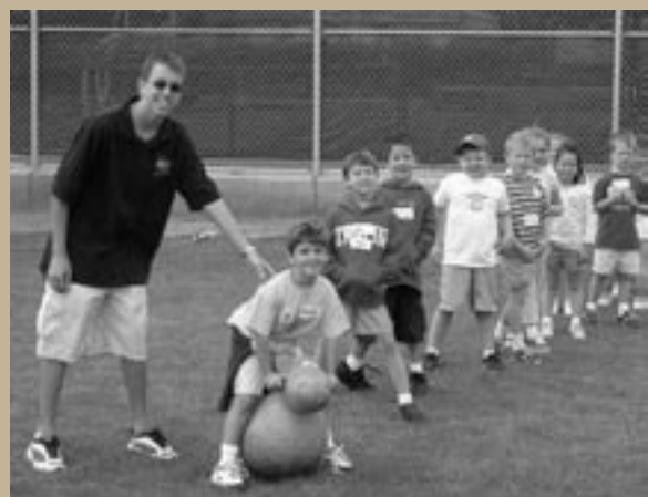
Summer Camp '04