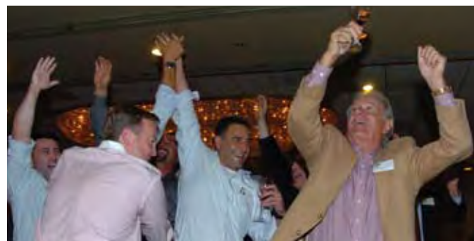
Padre alums reunite at the 2010 Reunion Gala and celebrate the success of the World Champion San Francisco Giants.