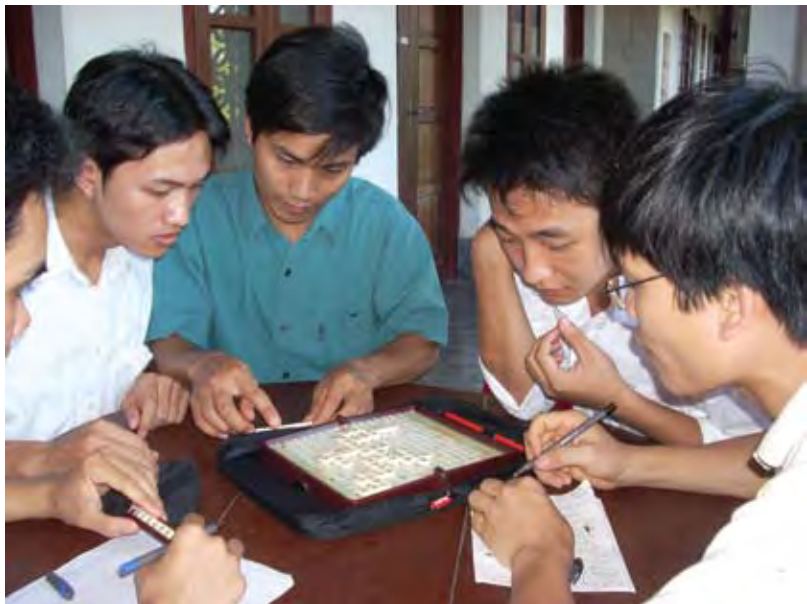
Vietnamese Catholic seminarians enjoy the game of Scrabble while learning English.