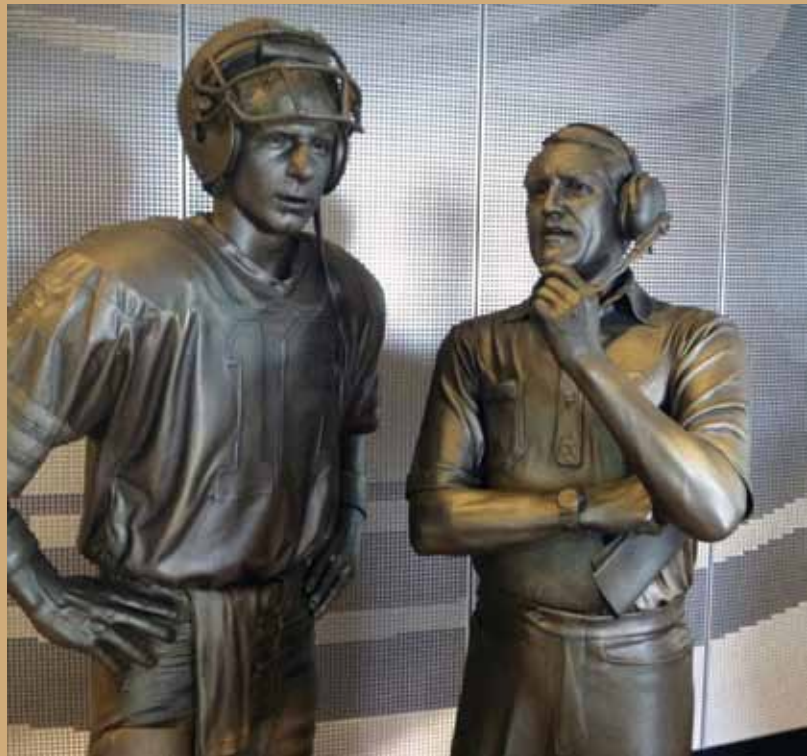
The careers of quarterback Joe Montana and coach Bill Walsh are intrinsically linked for 49ers fans. Their statues in the 49ers Hall of Fame stand side by side.

the history of the team from its inception in 1946 and includes vintage photographs. There are exclusive interviews with 49ers superstars Joe Montana, Ronnie Lott, Roger Craig and Jerry Rice, as well as memorable 49ers from the past, such as Y.A. Tittle, Joe Perry and Hugh McElhenny.