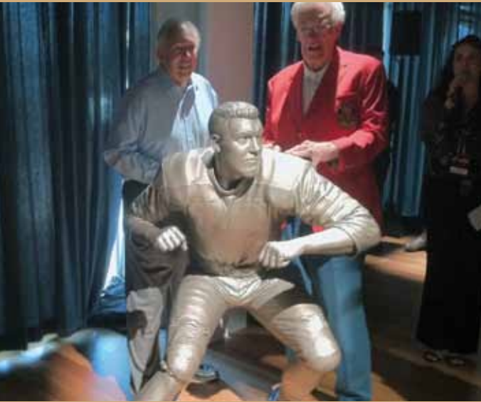
John Brodie and tackle Bob St. Clair (right) stand behind St. Clair’s Hall of Fame statue. St. Clair participated in a record 189 football games at Kezar Stadium while playing for three San Francisco teams: Poly High School, USF and the 49ers.