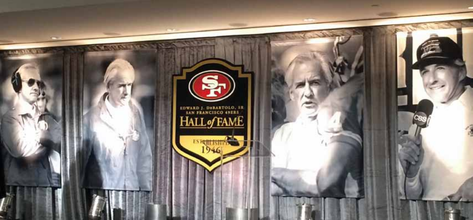
The podium is prepared for coach George Seifert, who is the most recent inductee into the 49ers Hall of Fame in 2014. Seifert grew up in San Francisco’s Mission District. He earned five Super Bowl rings with the 49ers.