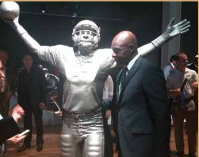
Jerry Rice, the greatest receiver in NFL history, reacts emotionally to the unveiling of his Hall of Fame statue.