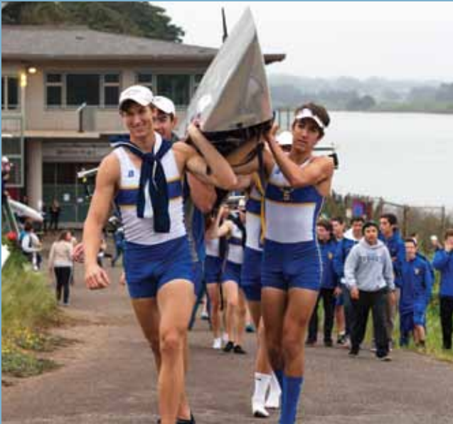
Varsity rowers carry their shell off the water after winning the Pacific Invitational Regatta held at Lake Merced in March.